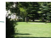
St. Patrick Park