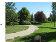
Albert Milne Park